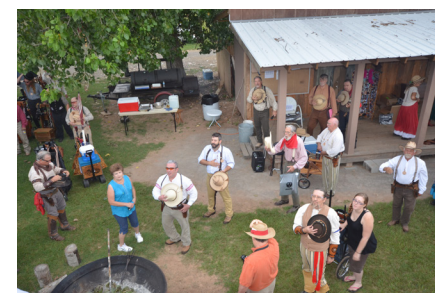
Pledge of Allegiance at the start of Day 1 of Hell On The Border

On Saturday July 20 and Sunday July 21, 2013 Judge Parker's Marshalls hosted our first annual match, "Hell On The Border" with 61 shooters ready to fight it out. The first time I heard what the name for the match would be I thought it was very appropriate for Arkansas weather in July. At this time last year, most of our area looked much like a desert with no rain and very high temperatures. Apparently my conception of Hell must be off a bit because we had cool temperatures and a great deal of rain for our match. I had chosen to wear my new hat with the pencil rolled brim and found that it was