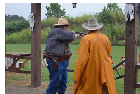
"Big Nasty" takes on the shotgun portion of a stage

a poor choice the first time I looked down at my guns on the loading table and dumped a cup of water on them. Even with all the rain, everyone had a great time.