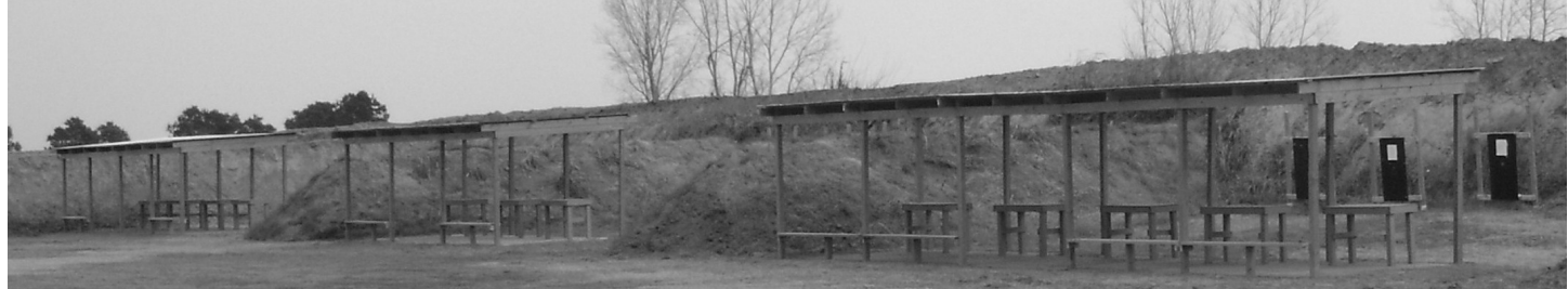
Finished Bays 8 through 10