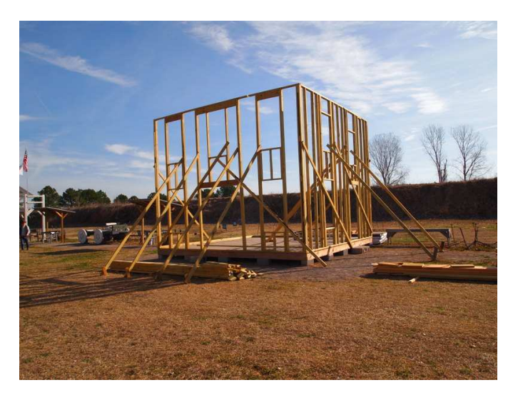
I apologize for the old pictures. I was not at the shoot and no one else took any new ones. Low Gap Kid